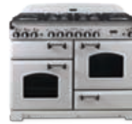
NEW VINTAGE WHITE